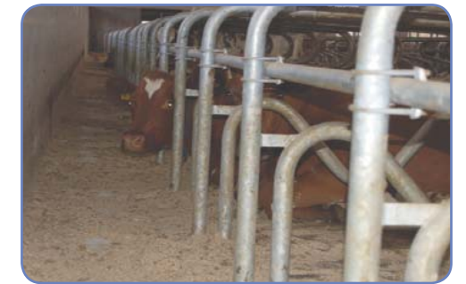
Standing area for cows.