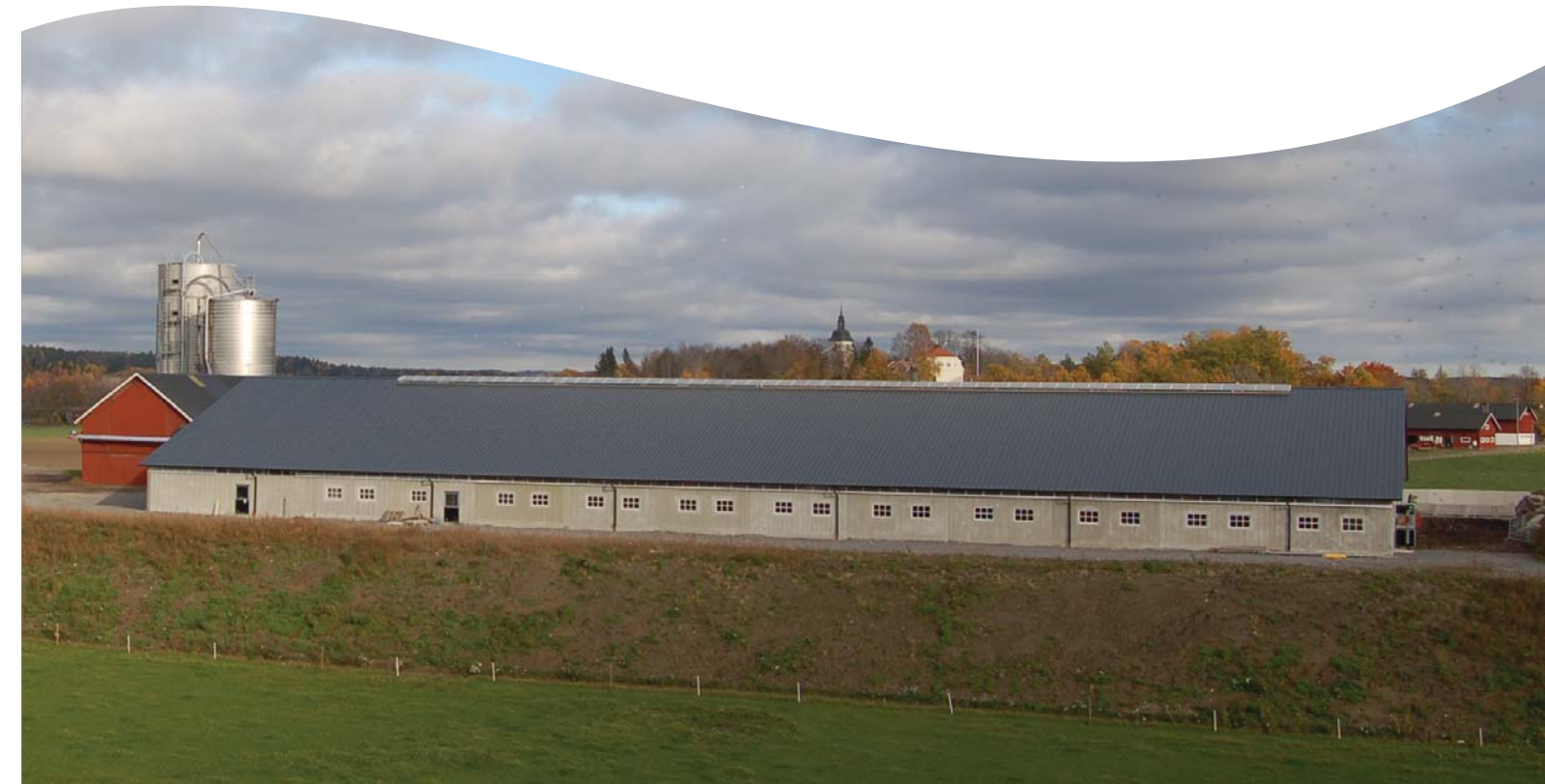
View of the barn. Light coming in at both the roof ridge, through the walls and the gable, provides light and pleasant barn.