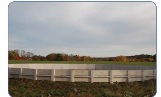
New manure container.