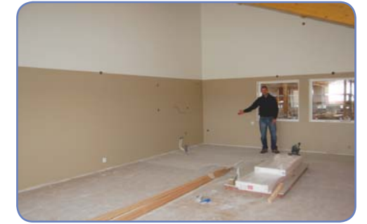
Pictures from visitors' room. Torbjörn shows where the pantry is to be located.