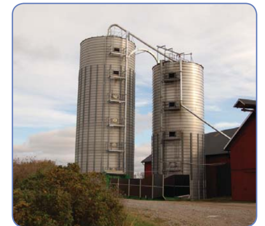
Silage stored in tower silo.