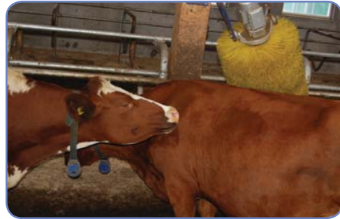
Appreciated cow brush for which there is often a queue