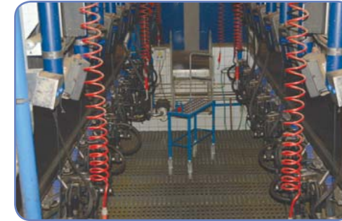
Milking stall with adjustable floor (raise and lower).