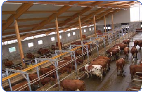
View of the barn. Light entering both at roof ridge, walls and gable, provides bright and pleasant barn