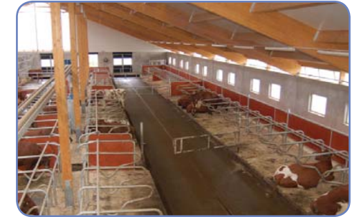
Open manure channel with rubber mat. Inspection walkway along the stalls.