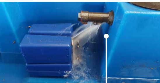
Adjustable brass valve

Heating element for water valve as accessory