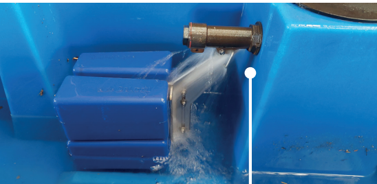
Adjustable brass valve